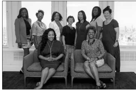
Members of the WOC Advisory Committee

This event was one of many WOC Around the World events held which united the WOC community. Other recent and upcoming events are scheduled to take place in Atlanta; Chicago; Dallas; Houston; Indiana; Los Angeles; San Francisco; Washington, DC; London, UK; Canada; and Europe. For more information about WOC Around the World events, visit www.woc-fp.com/woc-around-the-world . Sponsors of the WOC Awards include CCS Fundraising and